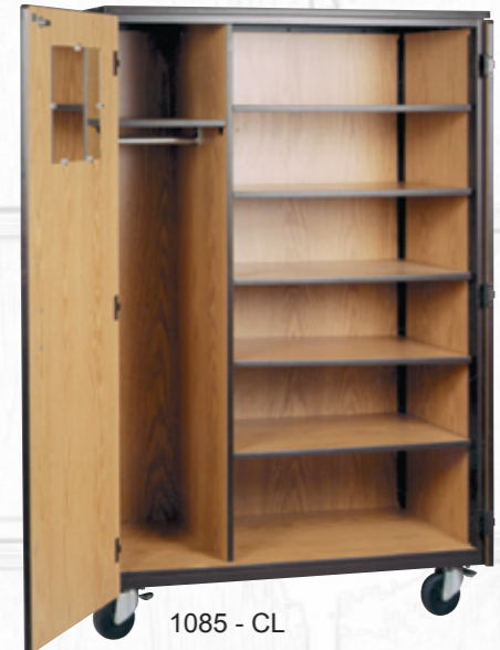
1085 - CL

CABINET WITH DRAWERS Key locked hinged doors, mirror, hanger rod, and hat shelf. 66" has three adjustable shelves and two full extension file drawers. 72" has three adjustable shelves 1086 - 48" W x 66" H x 22" D 1087 - 48" W x 72" H x 22" D