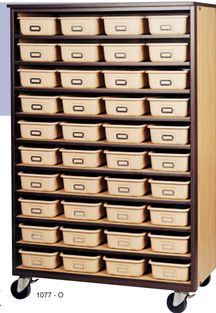
1077 - O

DRAWER-DOOR 1019 - 48" W x 36" H x 22" D