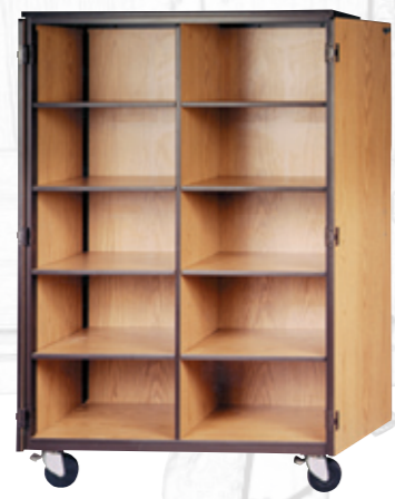
1042 - C

CUBICLE STORAGE Adjustable shelves can create twelve book size cubicles 14 3/4" W x 20" D 1044 - 48" W x 66" H x 22" D