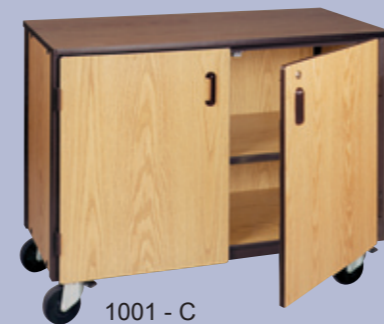
1001 - C

DOUBLE-DOOR 1001 - 48" W x 36" H x 22" D