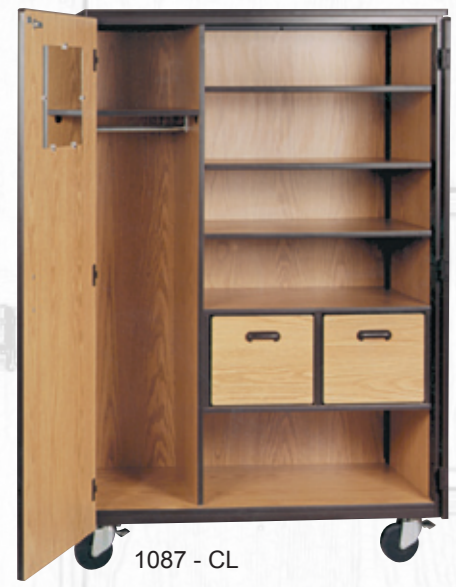
1087 - CL

CABINET WITH DRAWERS Key locked hinged doors, mirror, hanger rod, and hat shelf. 66" has three adjustable shelves and two full extension file drawers. 72" has three adjustable shelves 1086 - 48" W x 66" H x 22" D 1087 - 48" W x 72" H x 22" D