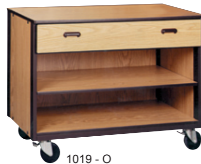
1019 - O

SINGLE-DOOR 1018 - 48" W x 36" H x 22" D