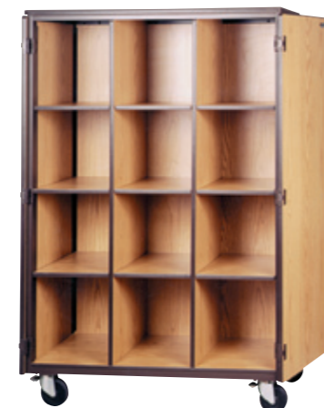
1044 - C

CUBICLE STORAGE Adjustable shelves can create twelve book size cubicles 14 3/4" W x 20" D 1044 - 48" W x 66" H x 22" D