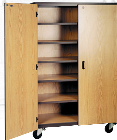
1041 - CL

CUBICLE STORAGE 66" has eight shelves 72" has ten additional fixed center shelf 1042 - 48" W x 66" H x 22" D 1043 - 48" W x 72" H x 22" D