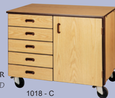
1018 - C

DOUBLE-DOOR 1001 - 48" W x 36" H x 22" D