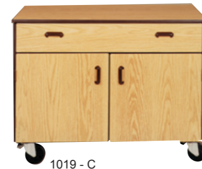
1019 - C

DRAWER-DOOR 1019 - 48" W x 36" H x 22" D