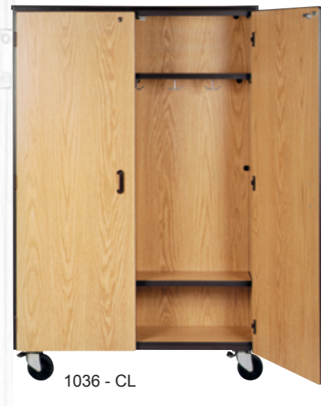
1036 - CL

TEACHER CABINETS Key locked hinged doors, mirror, hanger rod, and hat shelf. 66" has four adjustable shelves 72" has five adjustable shelves 1084 - 48" W x 66" H x 22" D 1085 - 48" W x 72" H x 22" D