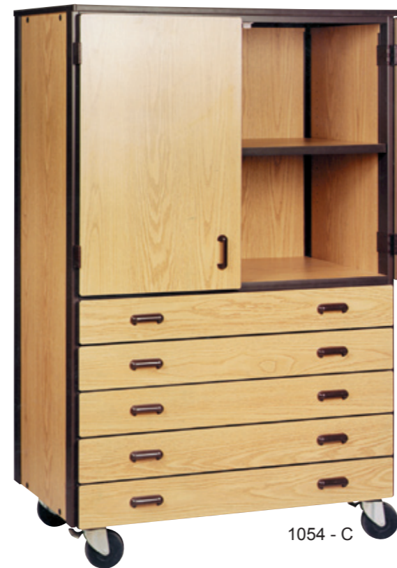
1054 - C

STUDENT WARDROBE Includes a hat shelf, 13 double coat hooks, and a lower adjustable shelf. 66" has four adjustable shelves 72" has five adjustable shelves 1036 - 48" W x 66" H x 22" D 1037 - 48" W x 72" H x 22" D